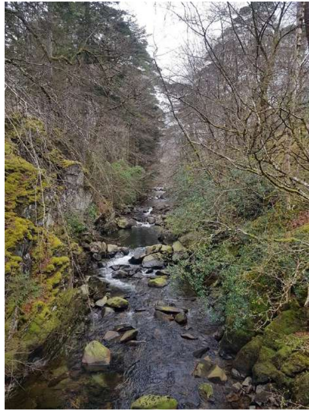
Ravine close to Airigh nan Lochan