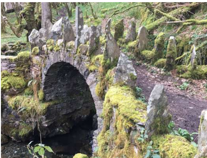
The Fairy Bridge