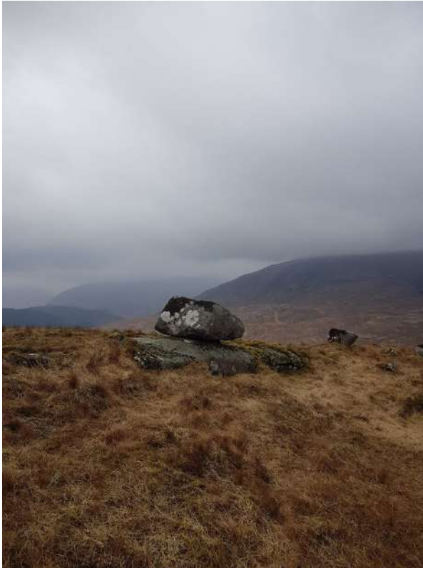
Loch Creran's down there somewhere