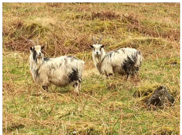
Huh? You talkin' to me?