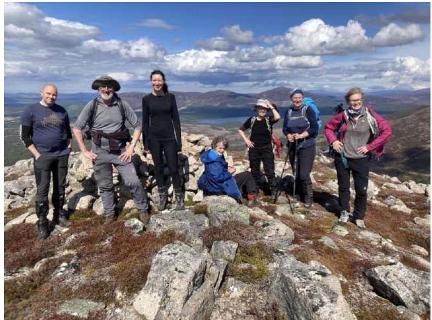
Higher crossing of the Allt Druidh & the group of Ptarmigans on Carn Elrig.