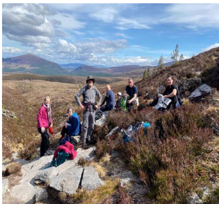
Ptarmigans heading up the Chalamain Gap & taking a breather.