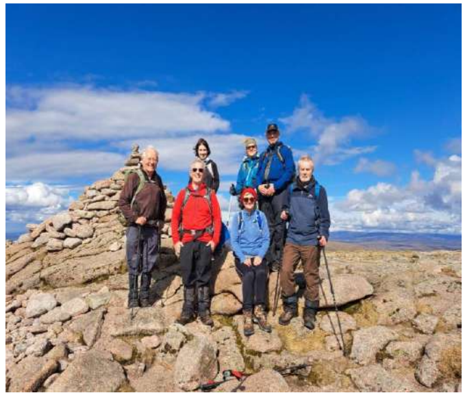
Ptarmigans en route & at the summit of Cairngorm